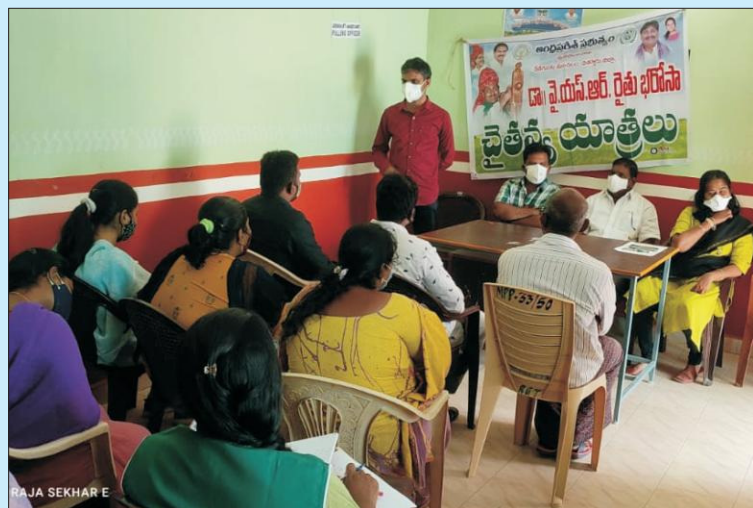
CVSc, Tirupati Staff Visited Rythu Bharosa Kendras

Faculty from College of Veterinary Science, Tirupati, Gannavaram, Proddatur, Garividi have participated throughout the state in “Rythu bharosa chaitanya yatralu” campaigns organized by the State Government at Rythu Bharosa Kendralu level from 09 th July 2021 to 23 rd July 2021 and addressed the participating farmers to bring awareness on various aspects of livestock production and shared the best practices.