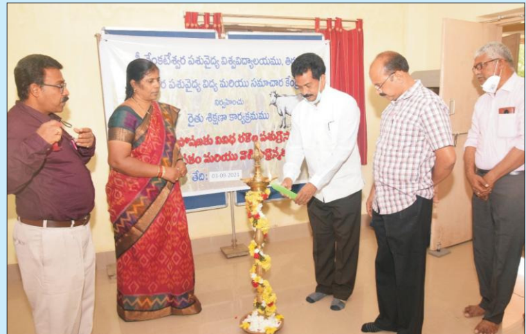
Farmers Training Programme Conducted at CCVEC

With an objective to orient the dairy farmers on the importance of feeding improved fodder varieties for profitable dairying, training programs on "Pashu poshanalo vividha pashugrasala pempakam" were organized by CCVEC on 3 rd September 2021 and 16 th September 2021. Dairy farmers from Saanambatla, Kandulavaaripalle, Mallayyagaaripalle, Ramapuram villages of Chandragiri mandal, Chittoor district have attended the training on 3 rd Sept 2021 and dairy farmers from Vadamalapeta, Kamalavarikandriga & SV puram villages of Vadamalapeta mandal, Chittoor district have attended on 16 th Sept 2021. All the farmers were thoroughly oriented on the importance of feeding improved fodder varieties to improve milk production in dairy animals.