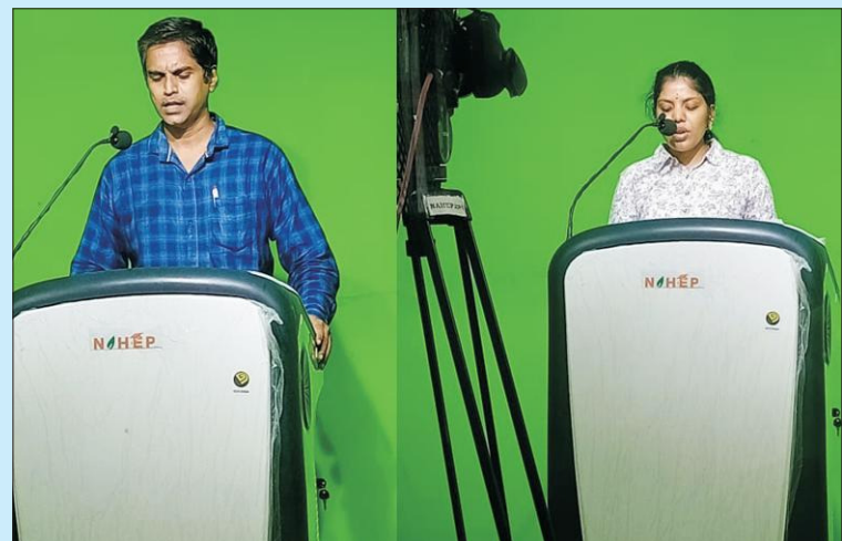
Radio Talks Recorded at CCVEC Digital Studio

Training programs were organized at KVK, Guntur on Vermi composting, Value addition of Papaya, Immunity boosting foods, Importance of value addition of fruits, IPM and Disease management in Paddy and Chilli, Importance of seed treatment for pest and disease management, Beekeeping, Fertilizer management through soil