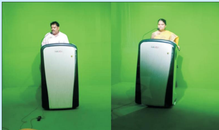
Radio Talks Recorded at CCVEC Digital Studio

yajamanyam”, “Viluva chekuritha mamsa padartala thayari”, “Tholakarilo pashuvulalo vache vyadhulu”, “Padi pashuvulalo eenina tarvata vache vyadhulu”, “Broiler kodi mamsamu pramukyatha”, “Virus valana pashuvulalo vache vyadhula nivarana”, “Eenina tarvata pashuvulalo teesukovalasina jagrattalu” and “Lega dudalalo vache vyadhulu teesukovalasina jagrattalu”.