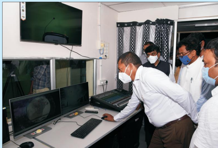
Hon'ble Minister Visited Digital Studio