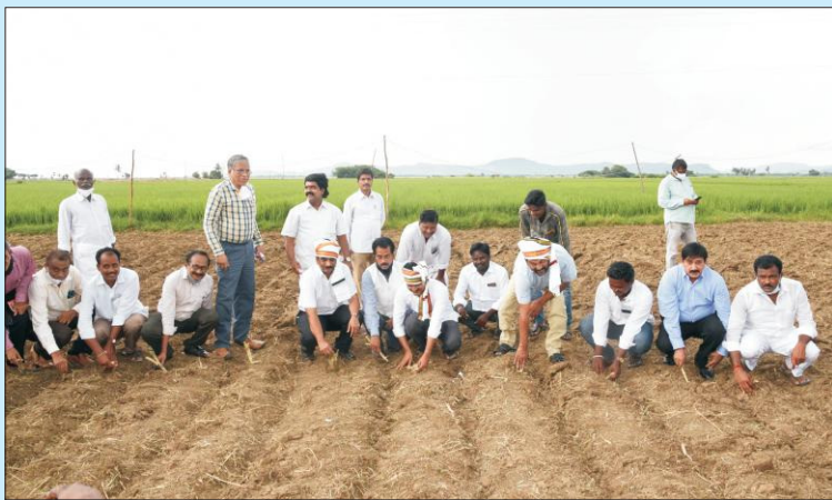
Establishing Super Napier Demonstration Fodder Plot at Mannasamudram