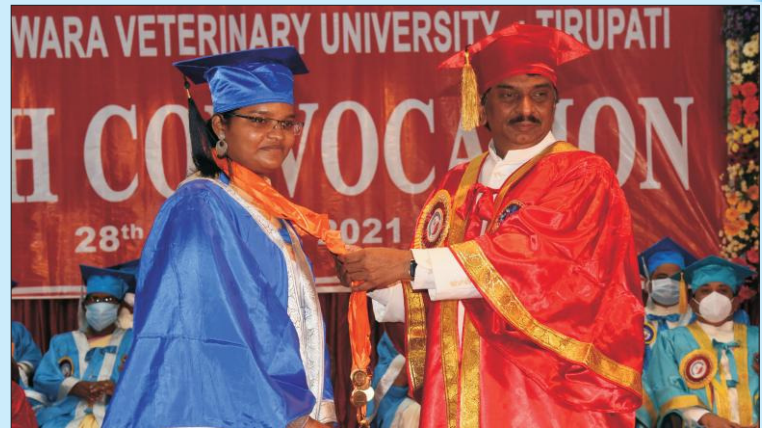
Student of CVSc, Proddatur Received 11 Gold Medals from Hon'ble Vice Chancellor of SVVU