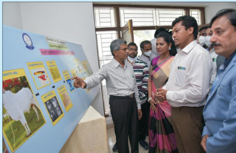
Hon'ble Minister Visited LRS, LAM, Guntur