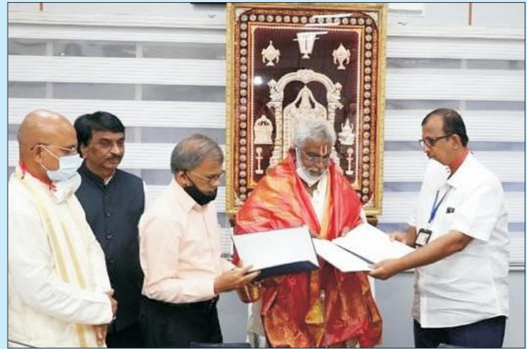
TTD Inks MoUs with SVVU

Hon'ble Minister of Animal Husbandry, Govt. of A.P., launched “ Mission Punganur ” at Embryo Biotechnology Laboratory, LRS, LAM and interacted with the scientists and got acquainted with the scientific protocols involved in the production of IVF embryos. Hon'ble Minister has visited the Ongole and Punganur breeding bulls maintained at the research station. Later, in a meeting organized at the Research Station, Hon'ble minister addressed the farmers, and congratulated the staff for their efforts in conservation and propagation of Ongole germplasm. Hon'ble Minister has declared that the Government of Andhra Pradesh is also very keen in developing Punganur breed by sanctioning a project titled, “Mission Punganur” with an outlay of Rs.69.36 crores in a span