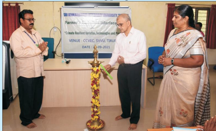
Farmers Training Programme Conducted at CCVEC

21 Radio talks were recorded at Digital Studio, CCVEC, SVVU, Tirupati from July to September 2021. During the month of July 2021, faculty from College of Veterinary Science, Tirupati delivered radio talks for the benefit of farmers on (12) selected topics.