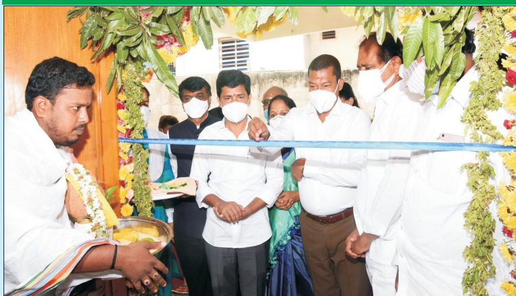
Hon'ble Minister Inaugurated New Building at the Thathaiahgunta Town Hospital

Hon'ble Minister of Animal Husbandry Dr. Seediri Appala Raju Garu visited Dr. Pratap V. Reddy Feed & Forage Analytical Laboratory, Museum at Dept. of Pathology, State Level Disease Diagnostic Laboratory (SLDL), Tirupati on 01.07.2021 and got acquainted with various facilities available and different services provided to the farmers by the institutions. Later Hon'ble Minister has inaugurated the New Buildings built for the use of City Veterinary Complex at Thathayyagunta, Tirupati and Livestock Farm Complex (LFC) at College of Veterinary Science, Tirupati.