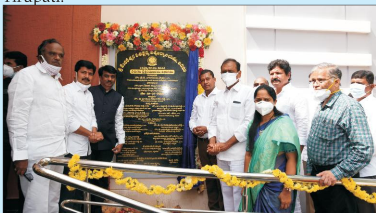
Hon'ble Minister Inaugurated New Building of the LFC

Hon'ble Minister of Animal Husbandry Dr. Seediri Appala Raju Garu visited Dr. Pratap V. Reddy Feed & Forage Analytical Laboratory, Museum at Dept. of Pathology, State Level Disease Diagnostic Laboratory (SLDL), Tirupati on 01.07.2021 and got acquainted with various facilities available and different services provided to the farmers by the institutions. Later Hon'ble Minister has inaugurated the New Buildings built for the use of City Veterinary Complex at Thathayyagunta, Tirupati and Livestock Farm Complex (LFC) at College of Veterinary Science, Tirupati.