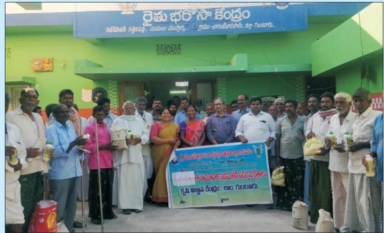
Farmers Training Programme Conducted at KVK, LAM, Guntur

Training programs were conducted on various topics like kitchen garden, millets and value-added products, immunity boosting foods, Integrated farming system, Bio fertilizer management, Integrated weed management, Nursery management in chilli, Integrated pest management in paddy and azolla cultivation at KVK Guntur.