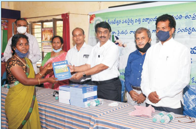
On the Occasion of Rythu Dinostavam (Ex Chief Minister of Andhra Pradesh Dr. YS Rajashekara Reddy Jayanthi) Hon'ble Vice Chancellor Distributed Pashu Vignana Karadeepika to Farmers