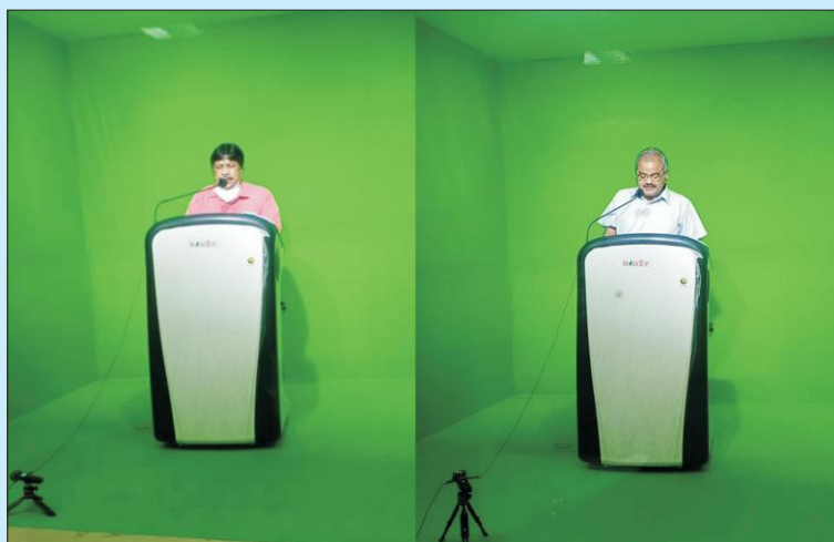
Radio Talks Recorded at CCVEC Digital Studio