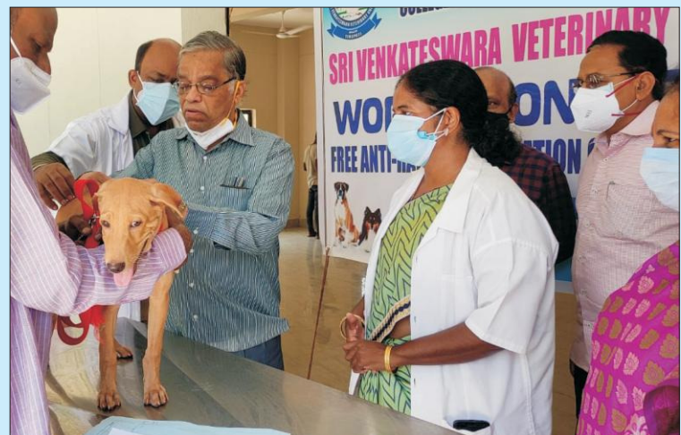
Zoonoses Day Conducted at DVCC, CVSc, Tirupati

All other SVVU institutions also conducted Zoonoses day and free anti rabies vaccination given to dogs and explained about different Zoonotic diseases that occurs in animals.