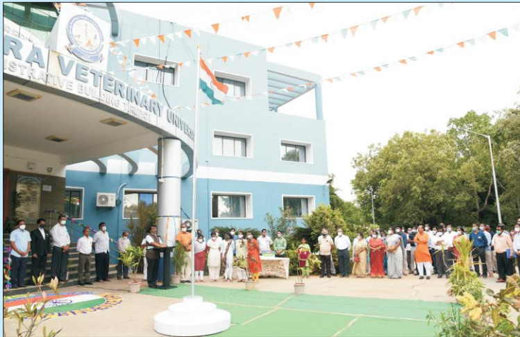
Independence Day Celebrated at SVVU