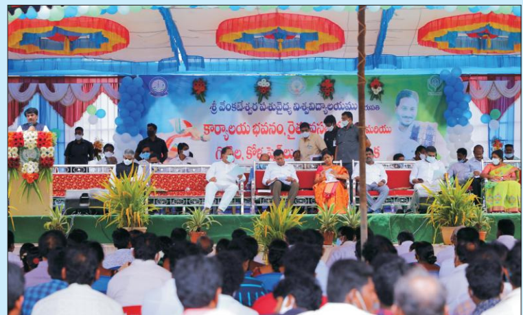
Hon'ble Vice - Chancellor Inaugurated New Building at the BRS, VR Gudem